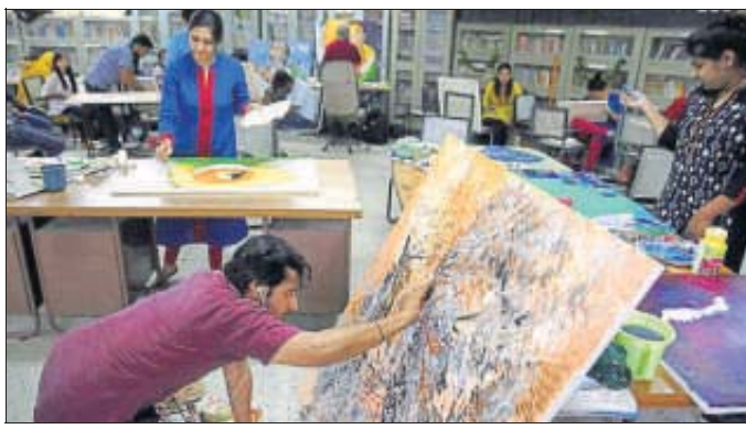
Artists at work at the 'message of the Mahatma' art camp organised at Rajasthan Adult Education Association in Jaipur on Tuesday.